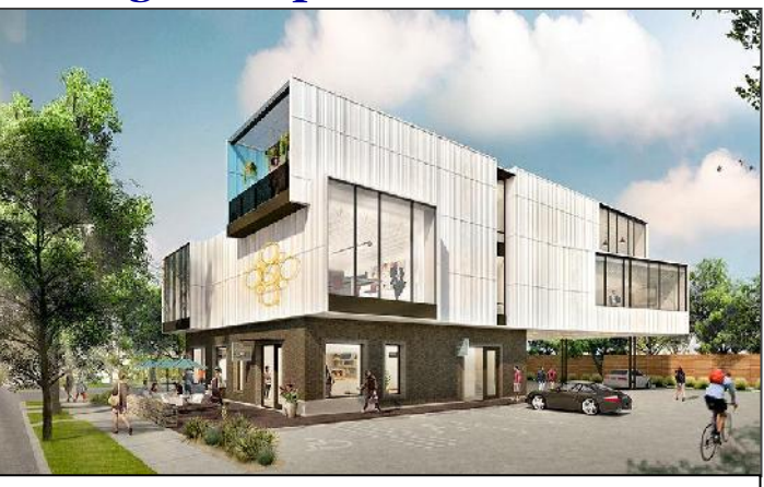
Rendering of proposed mixed use development at Bissonnet & S. Shepherd Drive

Steve Ybarra, owner of the northeast corner of Bissonnet and Shepherd, tells us that the former 4949 conveneince store will soon be demolished and construction of the new mixed-use development will begin before year's end. The ground level coffee shop will be a new concept collaboration between Platform and Greenway Coffee, operators of Blacksmith, Morningstar, and other local coffee shops. The upper floors will be office space.