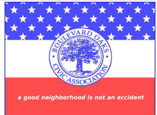
Right: 2 nd place artwork by Shy Artist